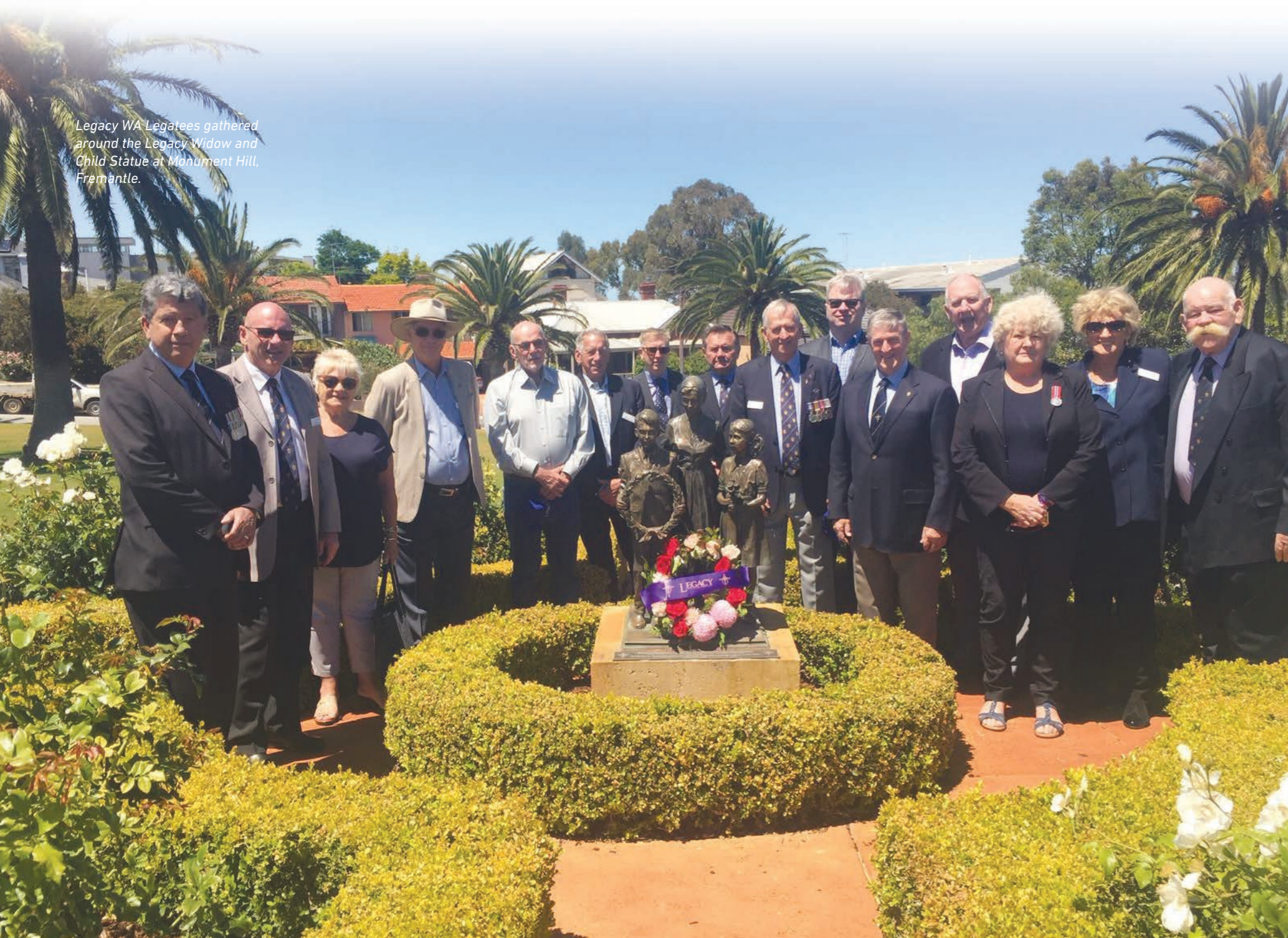
Legacy WA Legatees gathered around the Legacy Widow and Child Statue at Monument Hill, Fremantle.