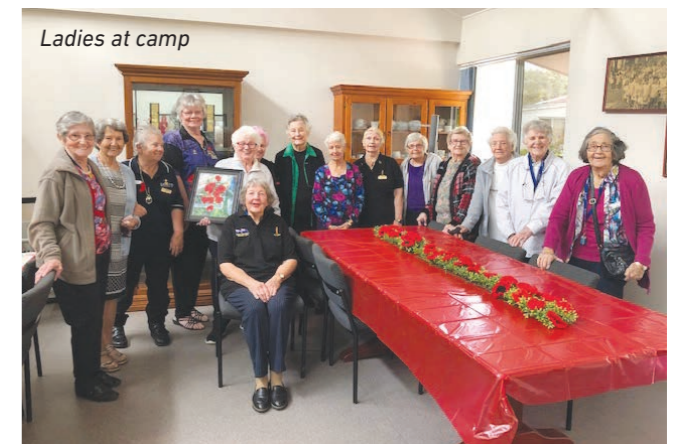
Ladies at camp