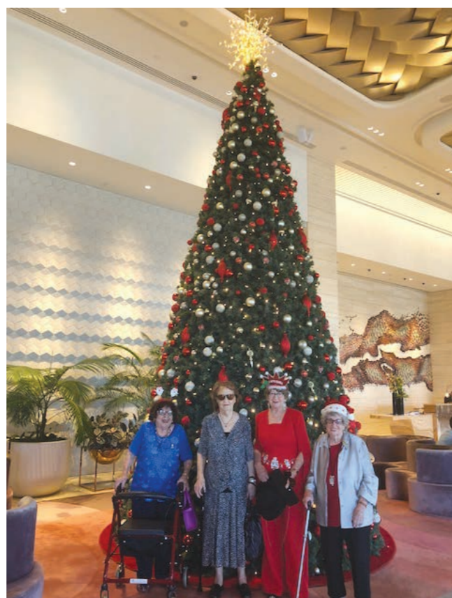
The South Perth Laurel Ladies at the Christmas Jingle.